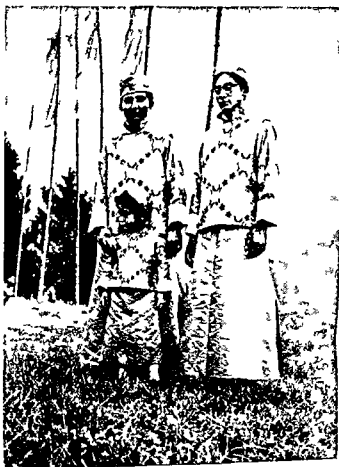
The Chogyal s three sons